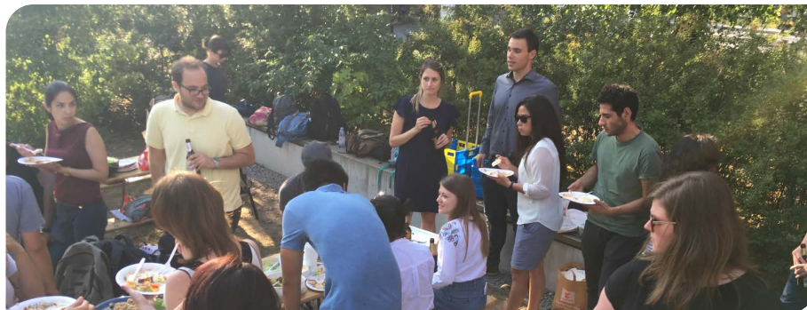
Our DAAD Welcome Day has become a great tradition – you can see here for yourself

On the other hand, our university benefits from the DAAD Helmut-Schmidt-Programme and its contribution to the internationalization.